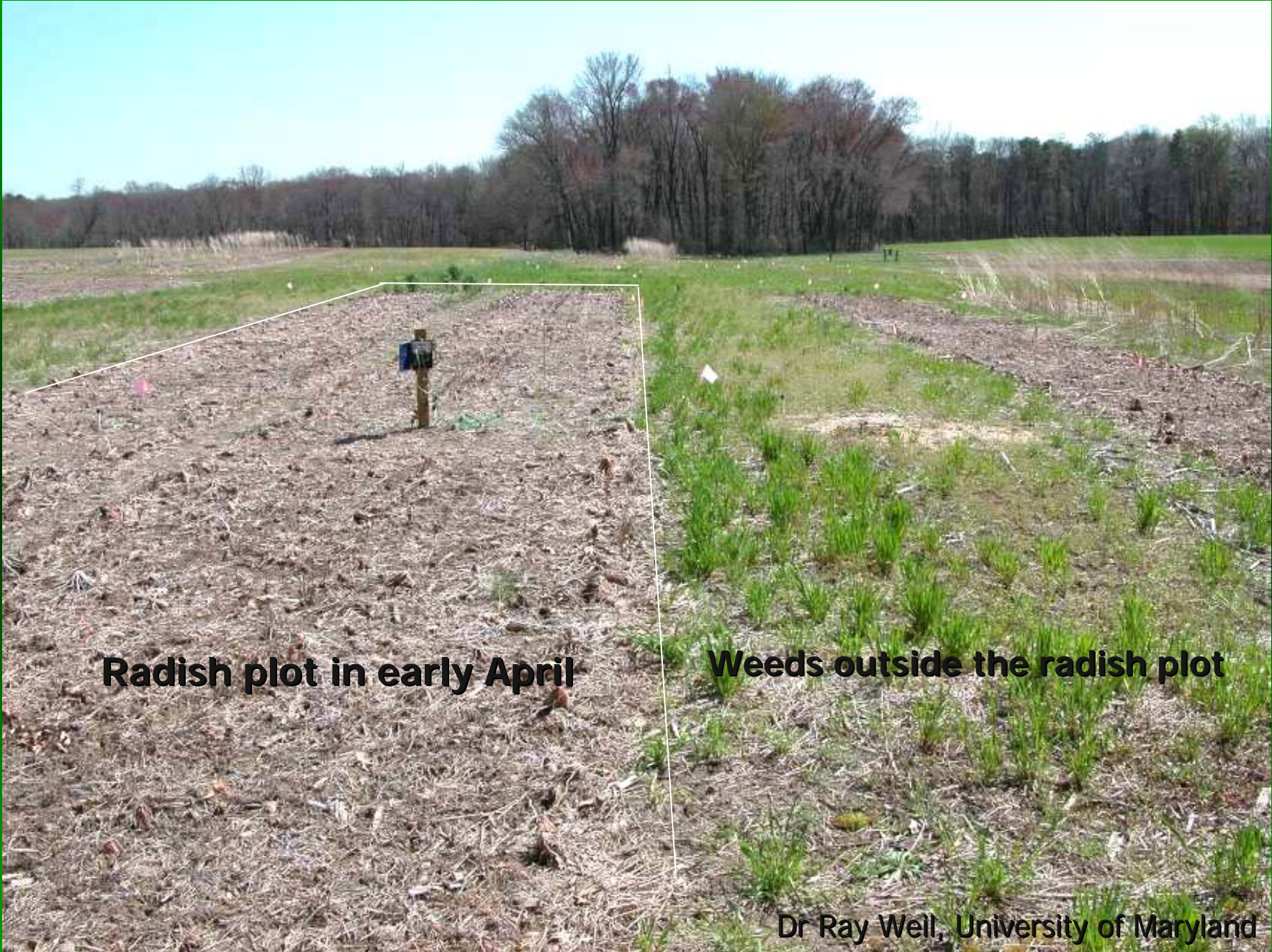
Radish plot in early April